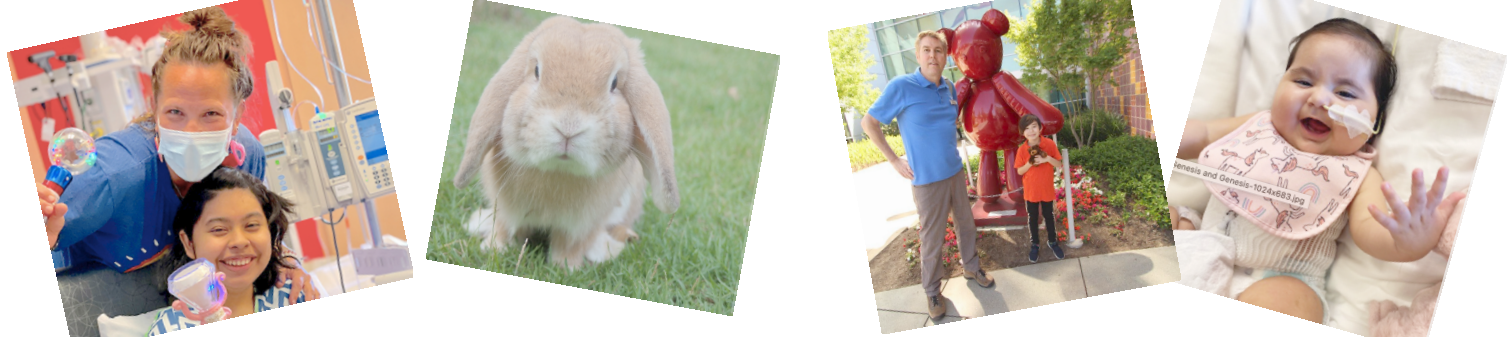
When You Put Others First, You Will Never Be Second!